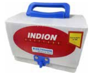
INDION® Easy Test Kit

Specially designed for on-the-spot analysis of cooling water without a trained chemist